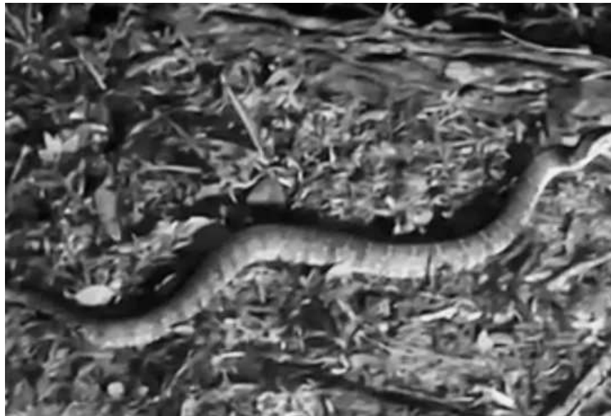
Snake on Memorial Park walkway